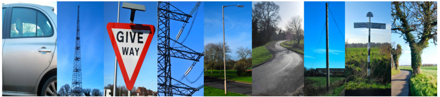
Dawn Ryder 8D1